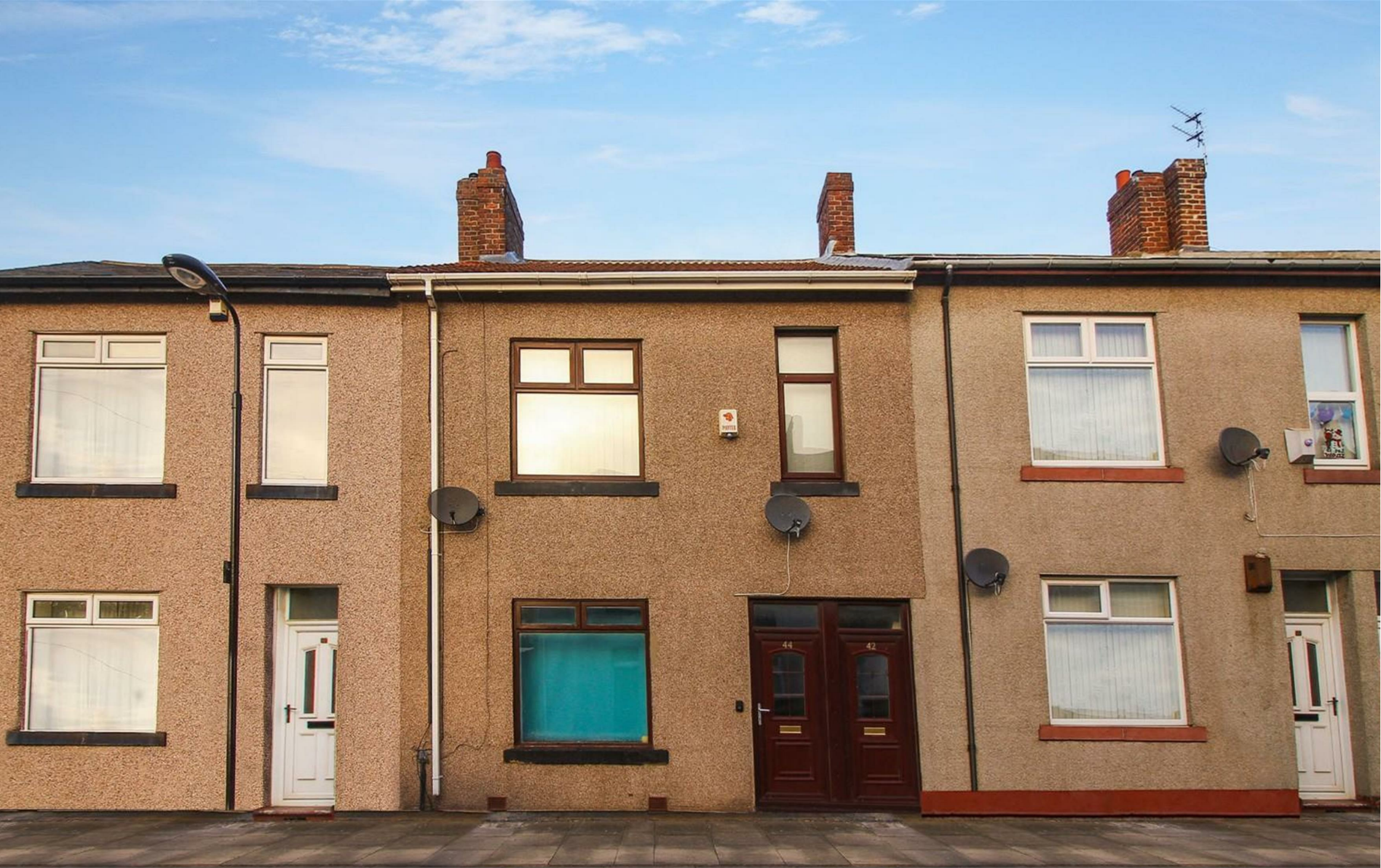
📍 Morpeth Terrace, North Shields NE29 7AN